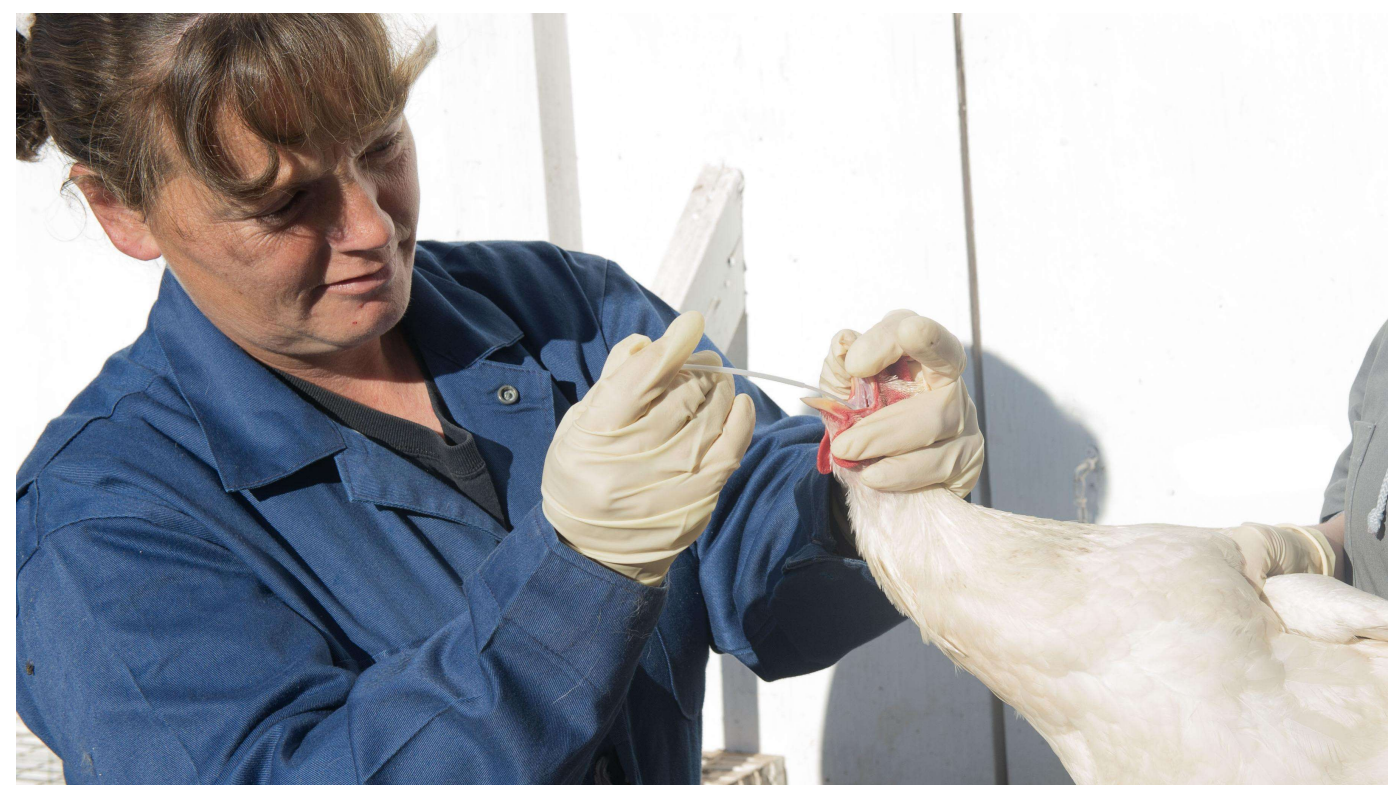
Ensuring Pure, Safe, Potent, and Effective Veterinary Biologics

We ensure that veterinary biologics-including vaccines, bacterins, antisera, and diagnostic test kits-used to diagnose, prevent, and treat animal diseases are pure, safe, potent, and effective.